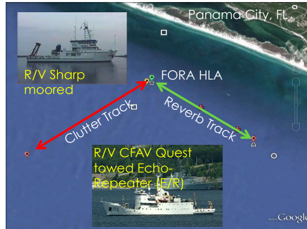
Figure 1: Map showing placement of the Five-Octave Research Array (FORA) horizontal line array (HLA) during the 2013 TREX data collection. The R/V Sharp collected monostatic sonar data from the HLA while R/V CFAV Quest towed an echo repeater (E/R) along the clutter and reverb tracks.

Figure 2 shows the target and array configuration during the 2013 TREX data collection. The FORA array was mounted 2 meters above the sea floor and oriented with endfire at approximately 353 degrees, while the E/R was towed along a reverb track at 130 approximately degrees and a clutter track at approximately 240 degrees.